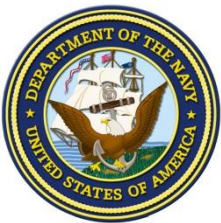
United States Navy